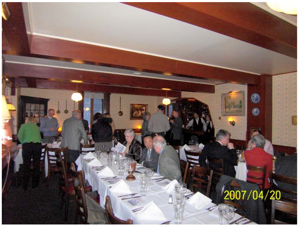
The Members and their guest arrive at the open bar.